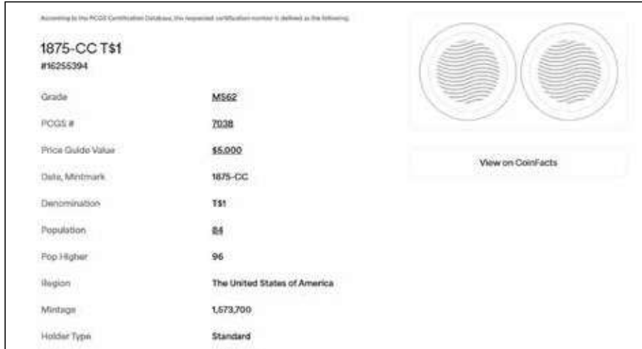
Screen-shot from the PCGS site for the claimed cert #

So I asked the seller for a better reverse image and that sealed the deal- a definite counterfeit coin! Image shows a known counterfeit 1874-CC, my 1875-CC and the subject example reverses: