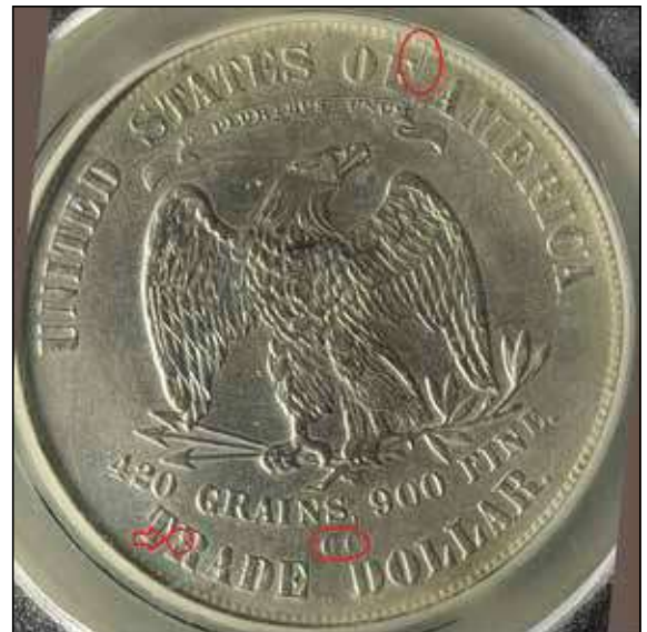
Subject reverse and matching attribution marks

And a full image of the reverse and matching attribution marks follows: