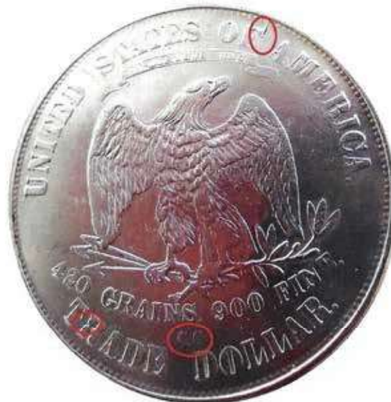
Author's Example of the “Notched R” family of Trade Dollars

Images weren't great but the reverse had the look of one I wrote about in the Summer 2025 Gobrecht Journal (#153) article on counterfeits, which I nicknamed the “notched R” Trade $’s: