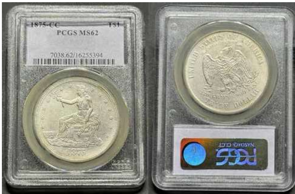
Images posted in the Bay listing

I notified eBay as well as my contact at PCGS while the bids keep climbing past $1,600.00 with two days left, but the seller actually ended the auction after a couple of messages between us: