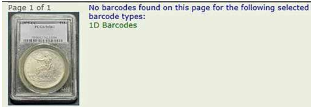
To my eye, surfaces look odd for an MS!