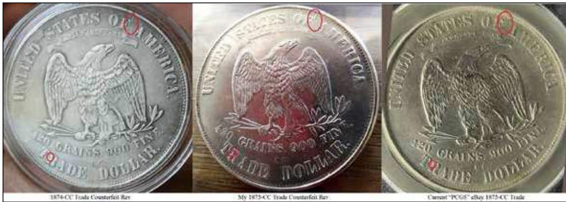
3 fakes and their reverses!

So I asked the seller for a better reverse image and that sealed the deal- a definite counterfeit coin! Image shows a known counterfeit 1874-CC, my 1875-CC and the subject example reverses: